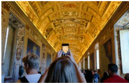
Sistine Chapel & St. Peter's Basilica