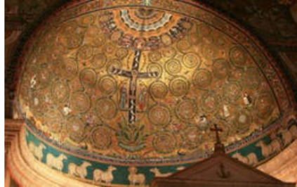
Basilica di San Clemente al Laterano