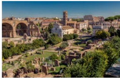
Roman Forum & Palatine Hill